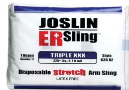
Triple XXX #J63538

Fits 90 - 250 lbs / 5' - 6' tall 41- 114 kgs / 152-183 cm tall