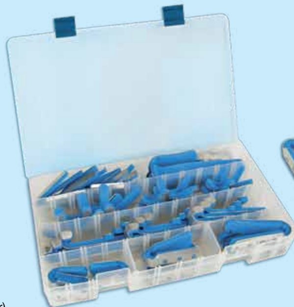
10030 Number 45 Specialty Splint Kit Schienset spezial Nr. 45 Speciale stecche kit no. 45 Spéciales d'attelles kit n°45