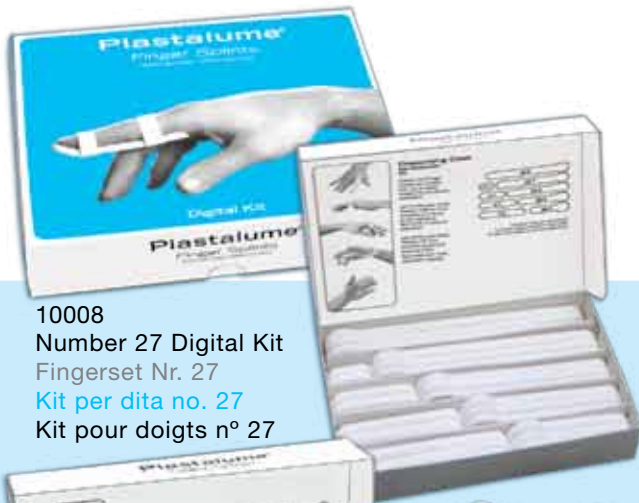
10008 Number 27 Digital Kit Fingerset Nr. 27 Kit per dita no. 27 Kit pour doigts n° 27

Fingerschienen • Stecche del ditto • Attelles pour doigts d'attelles