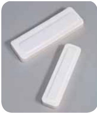
Arm Boards Armschiene Stecca per braccia Support pour le bras