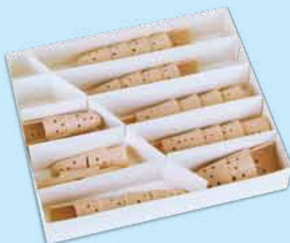
10020 Number 30 Stax-Mallet Kit (Beige) Stax-Mallet Set Nr. 30 Stax-Mallet kit no. 30 Stax-Mallet kit n°30