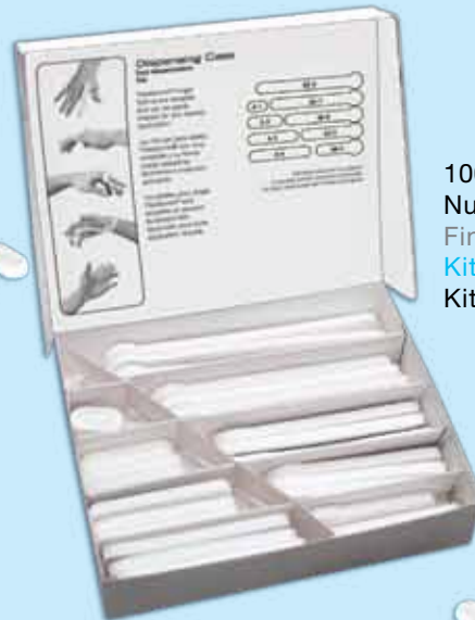
10003 Number 40 Digital Kit Fingerset Nr. 40 Kit per dita no. 40 Kit pour doigts n° 40