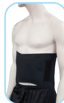
30108 Back Wrap