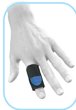
10303 (Small) 10304 (Medium) 10305 (Large) Finger Sleeve