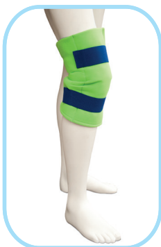
30103 (Standard) 30104 (Large) Arthroscopy Knee Wrap