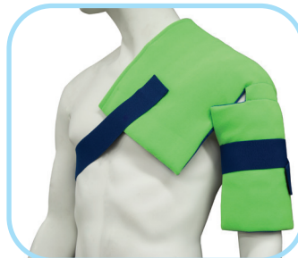
30100 Shoulder/Hip Wrap