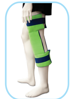
30102 CPM Knee Wrap