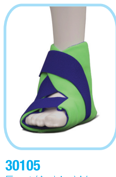
30105 Foot/Ankle Wrap