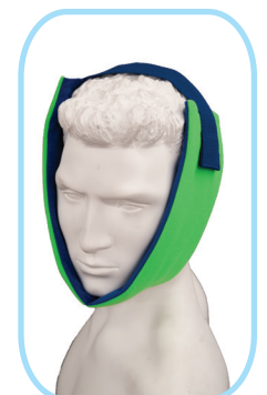
30109 TMJ Wrap