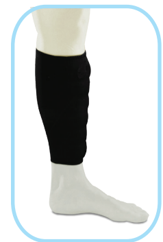
30011 (Small) 30013 (Large) 30012 (Med) 30014 (X-Large) Shin Wrap 30036 (Universal)