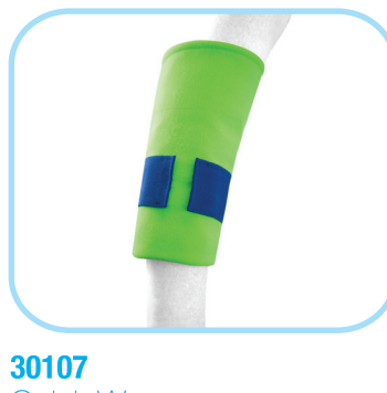
30107 Quick Wrap